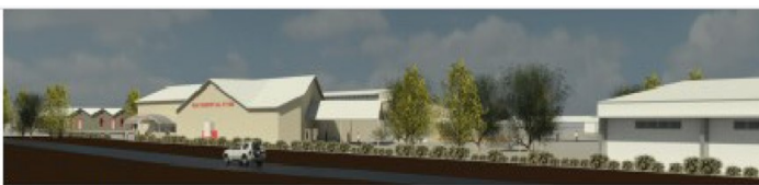
Perspective View 1 Scale N.T.S.