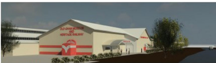
Perspective View 2 Scale N.T.S.